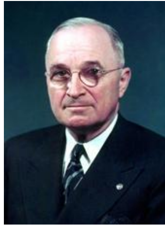
HARRY S. TRUMAN