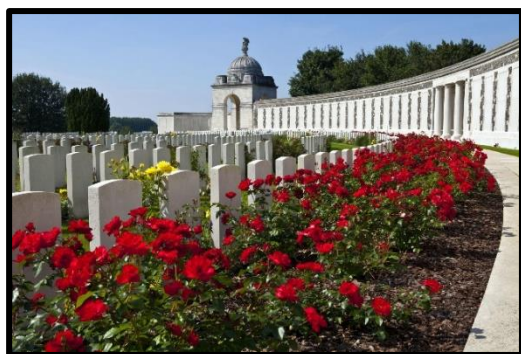
WW1 Graves France